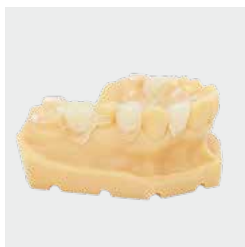
Tension-free and invisible restorations