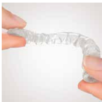
Maximum break resistance by thermoelastic flexibility

Universal powder-liquid system for the production of flexible and break-resistant splints and interim restorations.