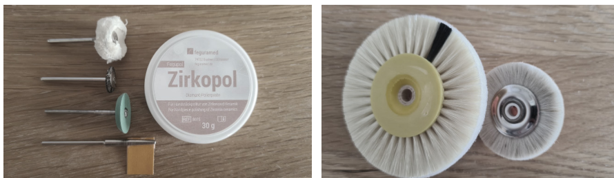
Fig. 3 and 4: Material recommendation for finishing

Finishing on the polishing motor: Removal of the support approaches by the help of emery paper (220 grit). Pre-polish with pumice stone powder and water and a hard polishing and goat hair brush. High-gloss polish with a bison or goat hair brush, followed by a cotton buff (diamond-coated polishing paste (Zirkopol; Fegupol, alternatively Dialux No. 40; Polidenta)). After cleaning, it is recommended to repolish with a cotton buff.